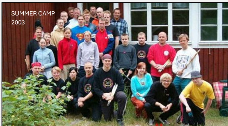
KOMBATAN FINLAND PATCH FROM THE YEAR 2003

In 2003, we held our first summer camp in Pomarkku, near Pori. Since then, the summer camp has been held every year, with the exception of the COVID-19 pandemic period.